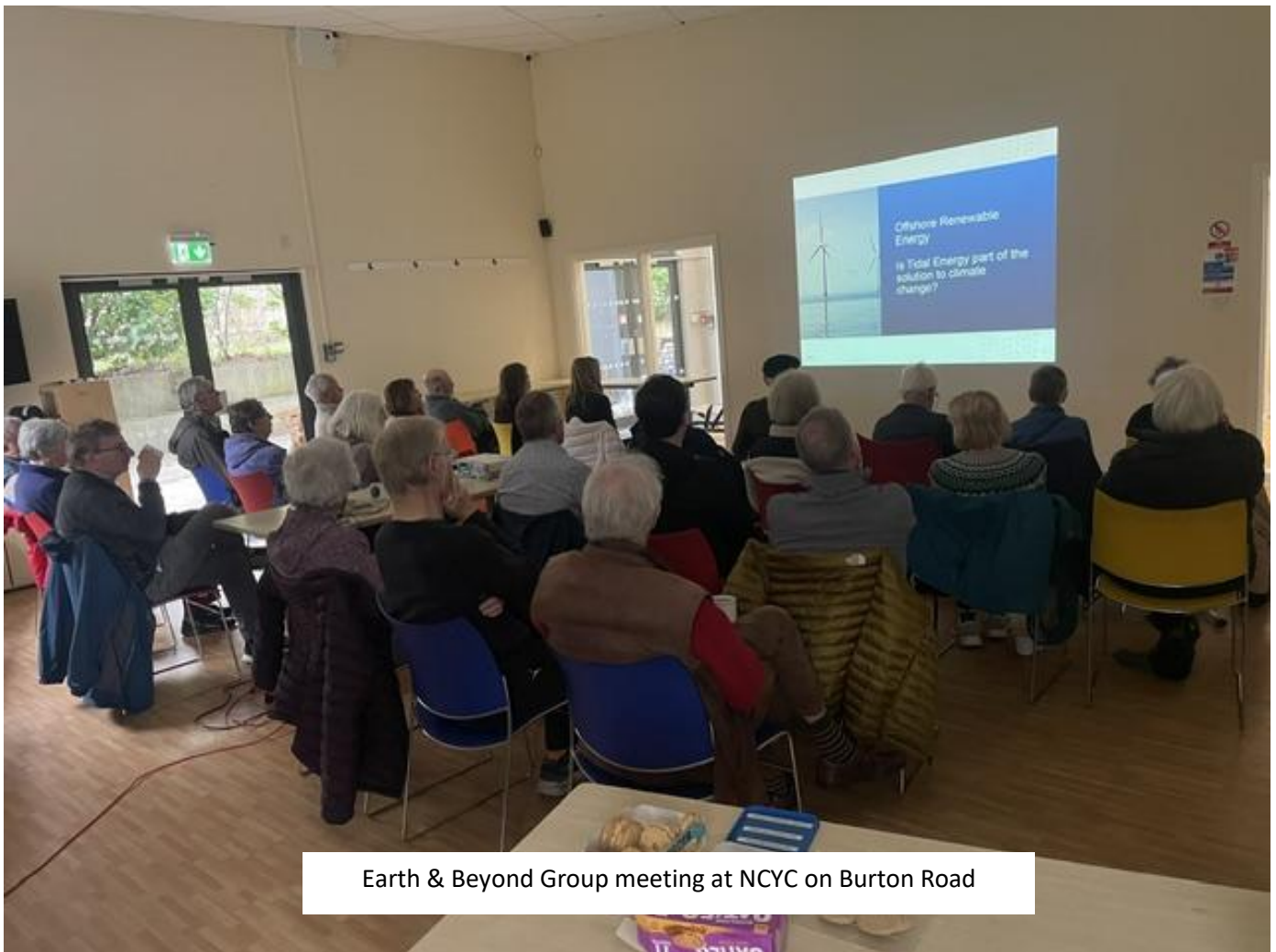
Earth & Beyond Group meeting at NCYC on Burton Road

Why not come along. We are sure you'll be pleased if you do.