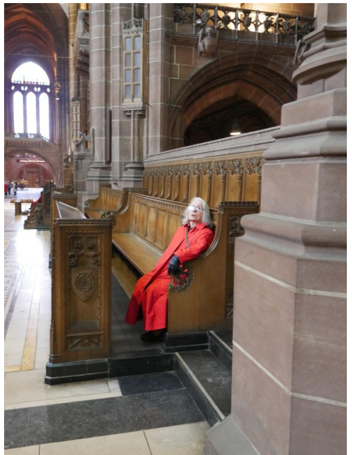
Cathedral Church of Christ in Liverpool, was designed by Giles Gilbert Scott who also designed Battersea Power Station, if you look at both there are similarities of form.