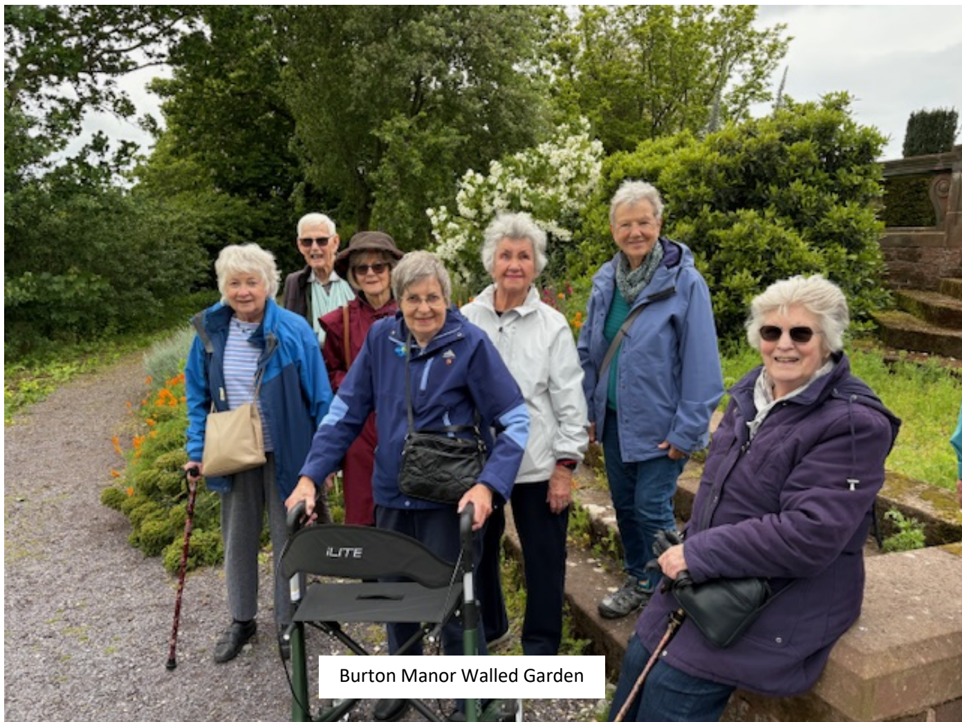
Burton Manor Walled Garden