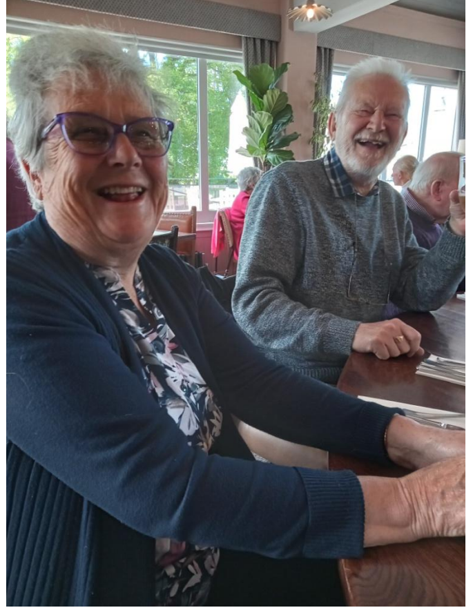
Everyone enjoying the lunch at the Red Fox