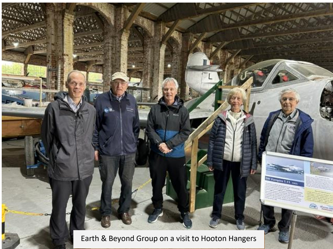
Earth & Beyond Group on a visit to Hooton Hangers