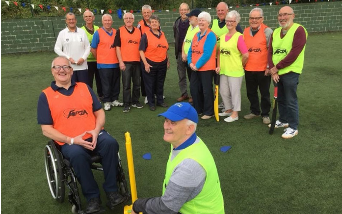
Barnsley U3A are planning a U3A Walking Cricket Tournament for U3A Day

The number of U3As on our dedicated closed Facebook page for this landmark day is now above 200.