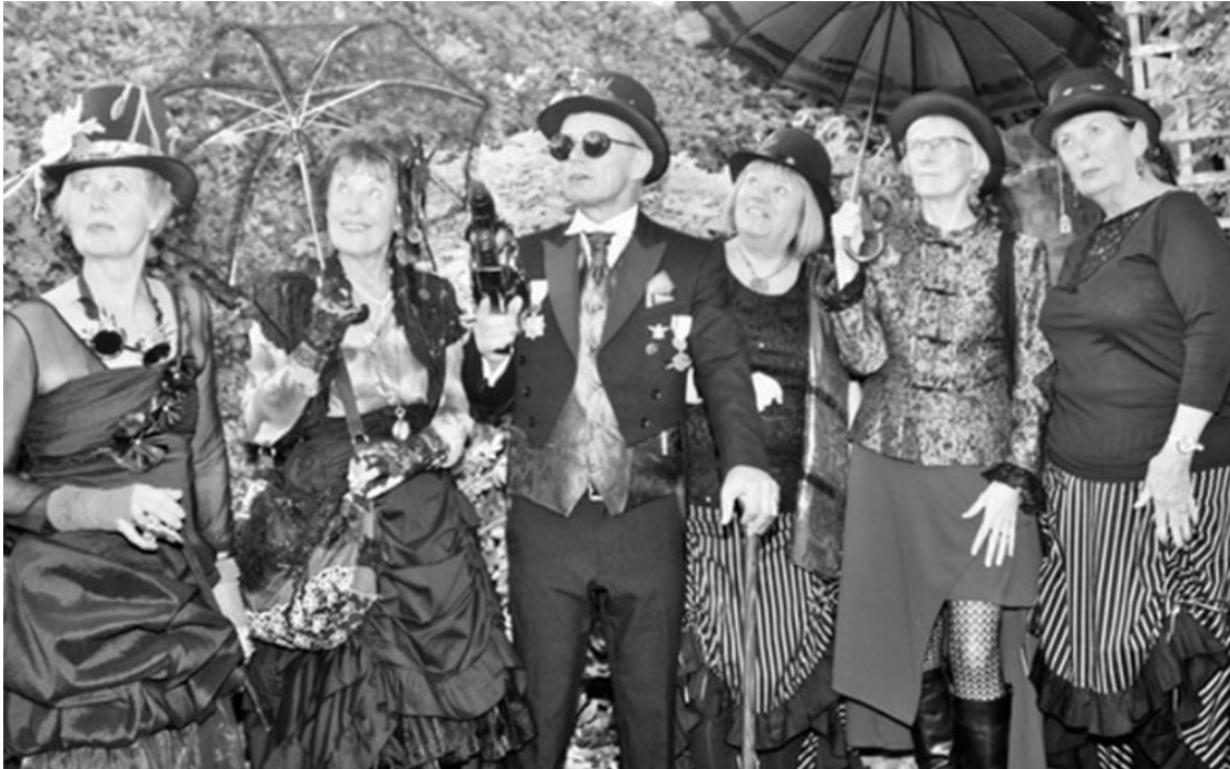
Congleton U3A Steam Punk group

Our blog - Sources Online - has some great new stories for the New Year! These include Congleton Steam Punk group (above), the Knicky Knack Knitters, Shared Learning Projects and much much more