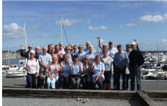
Malmesbury & District U3A Petanque group visited Guernsey to play a few games of Petanque with their colleagues and to see the sights of the island.

"We were delighted to be able to play in such a lovely spot, with much fun and laughter"