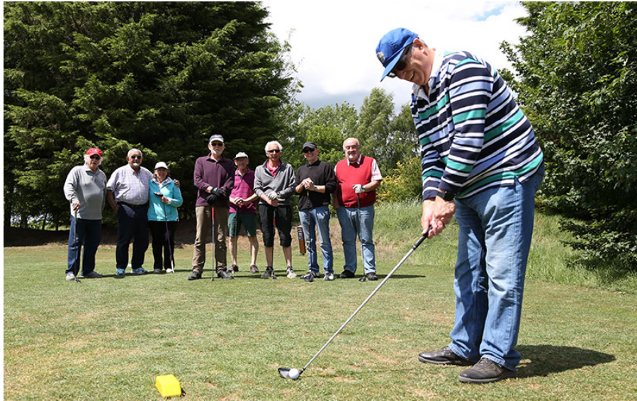
Royston U3A Golf Group