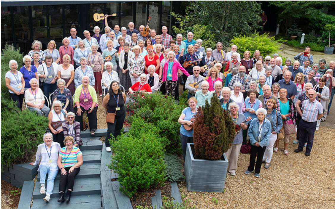
U3A students taking a break at National Summer School, Aston University, Birmingham

August remains a busy time for many of us as Summer Schools occur across the movement and also we have the national conference and AGM. I hope many of you who cannot attend the conference will join the AGM through the live streaming link.