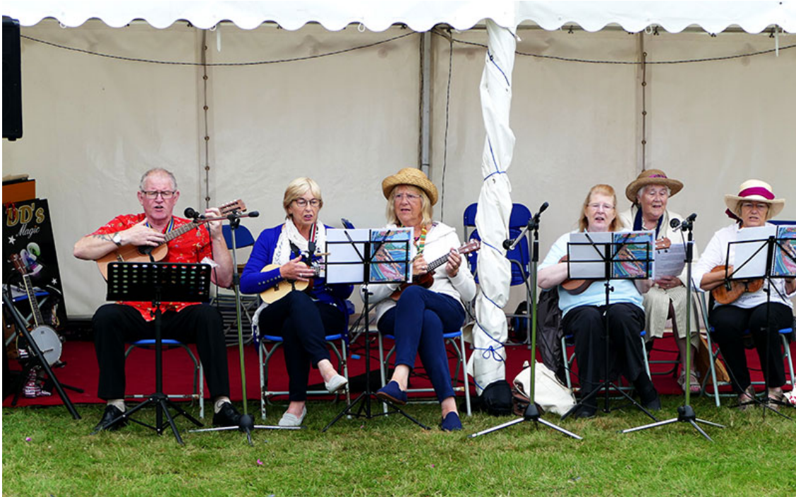
The Whitby Whaler Ukulele band entertaining crowds at 2019 Whitby Regatta