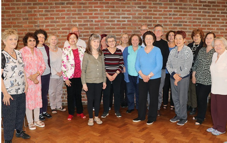
HGS U3A's Volunteer Celebration